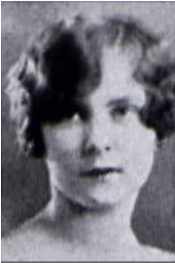
U. Of Arkansas yearbook photo ~1926